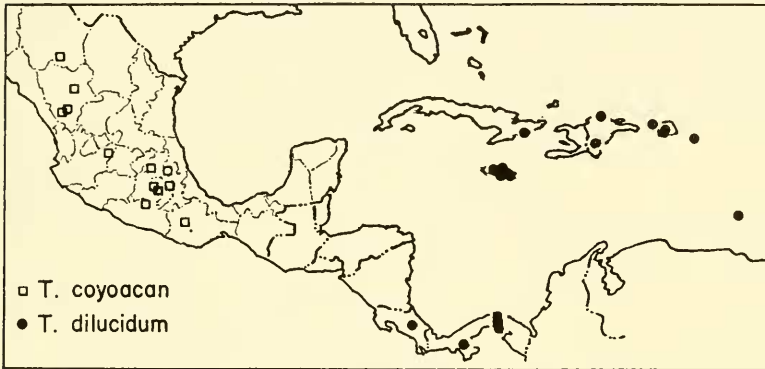
Map 2. Distribution of Theridion coyoacan , new species, and T. dilucidum Simon.

Comments. Type specimens of T. dilucidum were examined. The epigynum (Fig. 79) has an anterior curved sclerotized plate, and a posterior depression; in between is a projecting carina. This species is close to T. myersi Levi, but can be separated by the internal female genitalia.